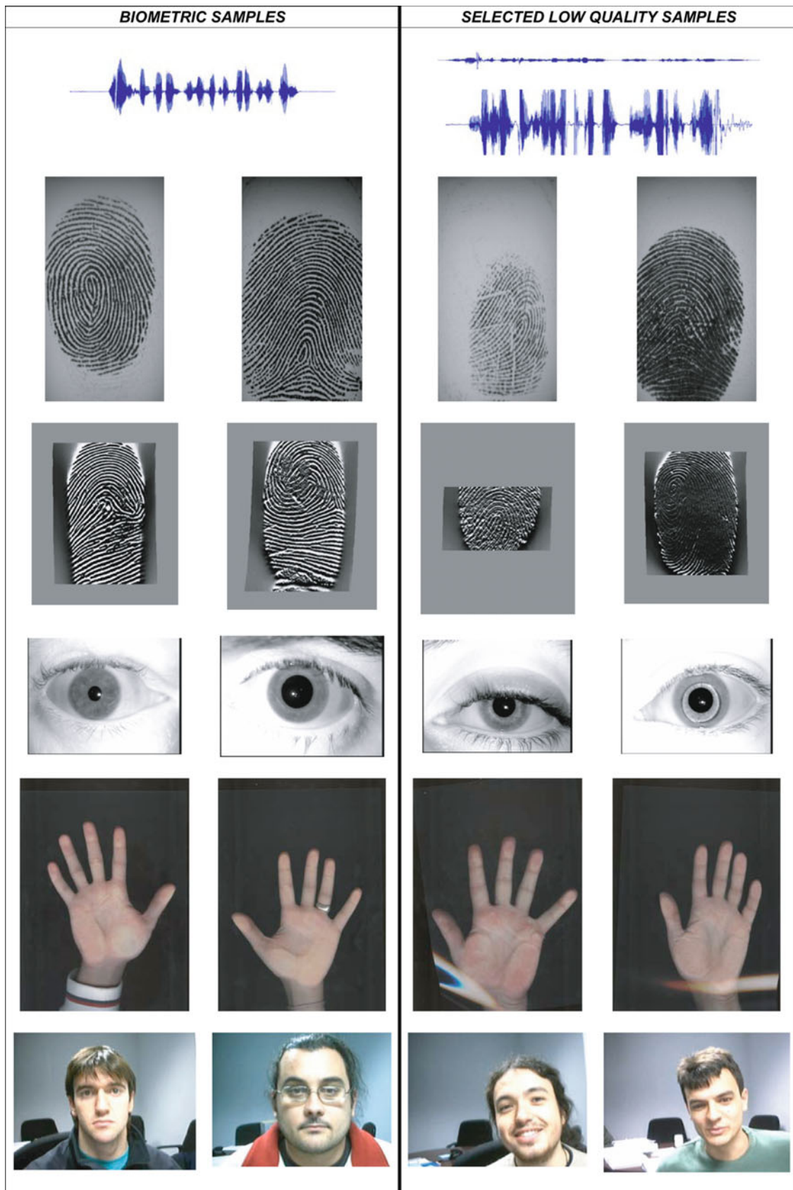
Fig. 4 Typical biometric data ( left ), and selected low quality samples ( right ) that can be found in the BiosecurID database