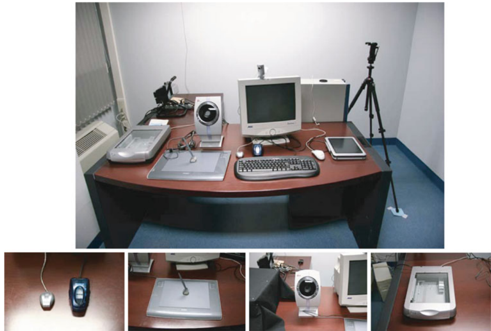
Table 3 Acquisition devices used for the BiosecurID database